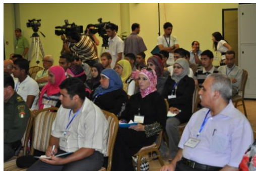
Media covering the final conference in the West Bank

The project completed all planned activities according to schedule, with the exception of the final conferences (see below). The training sessions in the West Bank took place approximately once a week between 6 January and 14 March 2011 in three West Bank locations: Jenin, Salfit and Al-Aroub. Training in Gaza was organized between 10 January and 21 March 2011, again weekly and in two separate locations in Gaza City.