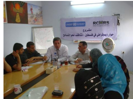
Project participants meet with a decision maker in Gaza

Participants from the American University in Jenin organized a meeting with four national decision makers “just to talk” and 150 students attended. In their villages and home communities, a number of participants became active in defending people targeted for their political or religious views. In one example, a participant mobilized a group of villagers to protect a known HAMAS sympathizer because “his human rights were not being respected”.