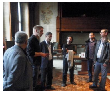
Visit to the municipal offices of Leiden

As part of the effort to help Palestinian young people to interact with decision makers, democratic processes and institutions, the project included a visit towards the end of the implementation period to “see democracy and tolerance at work”. The original plan was for two participants (one from each year, chosen on the basis of their performance during the project) and two coordinators to travel to Norway. However, the Norwegian embassy decided not to facilitate the trip, and eventually a visit was organized instead to the United Kingdom (UK) and the Netherlands.