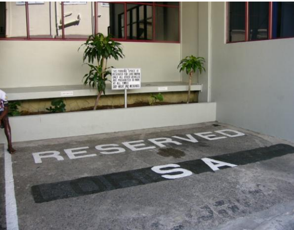
Sign of the times: Outside Suva city council offices, the parking space which once said ‘Lord Mayor’ has been painted over with ‘SA’ (Special Administrator).

Fiji has a President who is nominated by the Great Council of Chiefs, traditional leaders who advise the President on matters related to the welfare of indigenous Fijians. The President appoints the Prime Minister who is the head of government. Fiji’s bicameral legislature was suspended following a military coup in December 2006. In April 2009, the Fiji Court of Appeal ruled that the coup had been illegal, and a constitutional crisis ensued. President Iloilo abrogated the constitution, removed all office holders including all judges and the Governor of the Central Bank, and reappointed coup leader Commodore ‘Frank’ Bainimarama as Prime Minister.