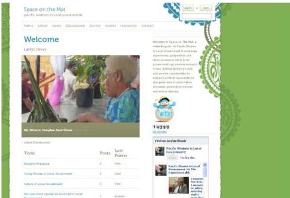
The WiLG network website home page

CLGF advised that they were not involved in the original design of the project until the draft was ready, when they were asked to comment. They felt the cause/effect analysis that IWDA used was too theoretical and led to a project being designed that was very complex in implementation. The project was “just too big”. This was one reason why some of the planned outputs were not completed and why CLGF had to top-up available funds from its general budget.