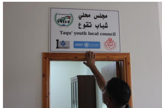
The YLC sign in Tqu'a

The project focused on the creation and work of Youth Local Councils (YLC) in six villages in the West Bank – two in the north, two in the central area and two further south. All the young people in these villages were mobilized to register to vote in the YLC elections and underwent training in citizenship, democracy and electoral processes. Public campaigns were organized by the YLC candidates and supervised voting was held that resulted in the election of between nine and 13 youth councillors in each village. Families, municipal councils, local non-governmental organizations (NGOs) and community members were involved in the campaign meetings or in overseeing the elections. The YLCs then received further training in the skills they would need in order to ‘govern’ effectively: negotiation, leadership, conducting meetings, fundraising, strategic planning and community action. They consulted with their youth constituents, the municipal council and community members, to devise a plan of action to contribute to their communities’ needs, and subsequently undertook a wide range of cultural and social activities, ranging from computer classes for other young people to the painting and renovation of school buildings.