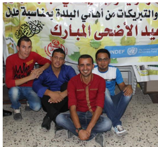
Young participants in Tarkoumea

The young people – not only the elected youth councillors but also the registered voters who were organized into working teams to implement the YLC action plan – said that participation in the project had increased their self-esteem, helped them to work with people and understand the importance of the “volunteer spirit”, as well as equipping them with useful skills acquired not only through the training sessions but also through the activities the YLC had implemented. One of the young women who had been elected to the YLC said that she had once been extremely shy but was now able to participate fully in meetings and address groups. The evaluators heard the story of one young woman youth councillor who had addressed an expert meeting in Ramallah and who had, to quote the trainer who had been there, “shaken us all up; usually these meetings are like a still pond but she caused ripples on the water and everyone appreciated that”. The trainer said the young woman had not been even remotely intimidated. “At our table,” he said, “the speakers were Doctor, Doctor, Doctor, then 17 year-old girl from Dura.”