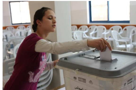
A young participant casts her vote at the Youth Council 2012 elections

In attempting to identify UNDEF value-added , the evaluators spoke to representatives of relevant UN agencies and NGOs. In particular, the evaluators interviewed another Ramallah-based NGO, CHF, which is also engaged in setting up what it calls “shadow councils” for young people in some villages in the West Bank. The evaluators learned that CHF and Almarid had at one time been partners in this work but that they had parted ways over a difference in approach (CHF does not make a direct link between education/training and the setting-up of the councils, and Almarid sees this as essential). CHF’s work is funded by USAID. The evaluators came to the conclusion that UNDEF’s support of the work being done by Almarid was particularly important because it maintained the focus on education and training in democracy, governance and leadership and that, in the long term, is crucial for the future of democracy in Palestine.