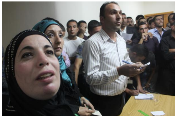
Awaiting the 2012 election results in Tqu’a

The elections followed strict procedures: sealed ballot boxes, checking of voter eligibility, a supervising committee of parents/teachers/NGOs, independent observers and scrutineers and so forth. A quota of 30 per cent female representation was set, reflecting the quota in place in local municipal councils (this was exceeded in five of the six YLCs).