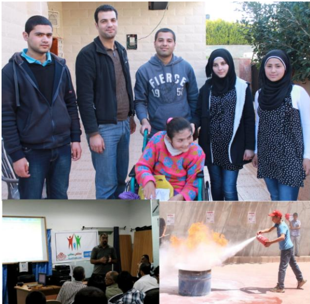
YLC social and cultural activities