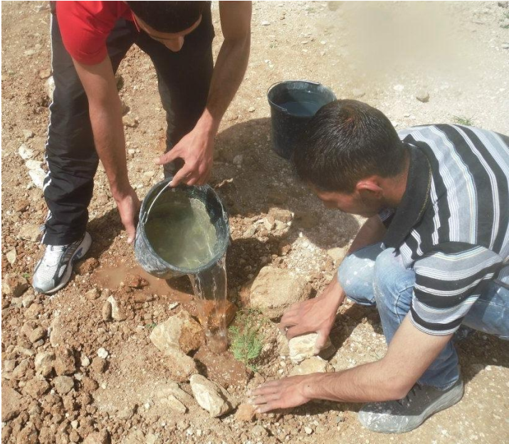
Youth environmental activities