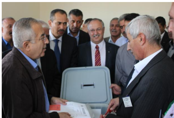
Former Prime Minister, Mr. Salam Fayyad at the Tqu'a 2012 election

The young people themselves had some success in taking their stories to the media, not only local newspapers but Palestinian TV and radio. The mayors and municipal councils informed relevant ministries of the Palestinian Authority (PA) about the project and indeed the Prime Minister attended one of the voting stations on Election Day.