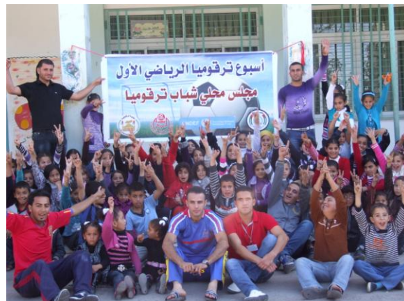
Sports day organized by the Tarkoumea YLC